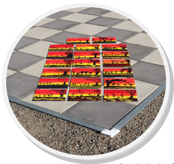
Acting Principal Venita Bacchetto